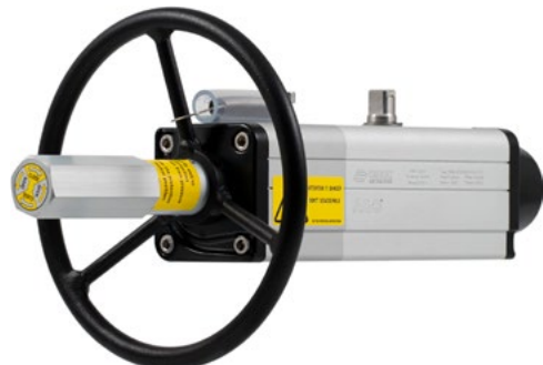
AGO HANDWHEEL PNEUMATIC ACTUATORS