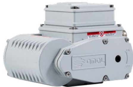
ELECTRIC ACTUATORS IP68