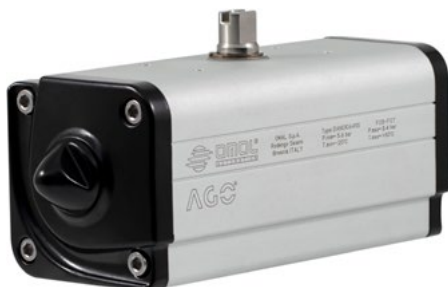
AGO PNEUMATIC ACTUATORS